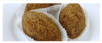
FRIED TARO DUMPLINGS (3) 5.45