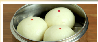
LAVA SALTED EGG CUSTARD BUNS (3) 5.45