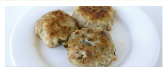
FLAT SHRIMP DUMPLINGS (3) 5.45