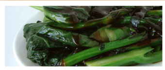
CHINESE BROCCOLI (3) 7.45