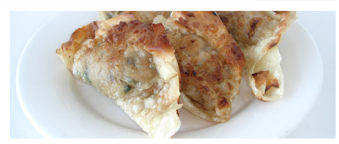
FRIED CHICKEN DUMPLINGS (4) 5.45