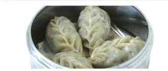
STEAMED VEGETABLE DUMPLINGS (4) 5.45