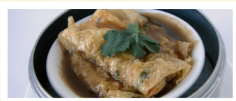
TOFU SKIN ROLLS (3) 5.45