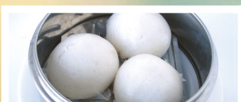
STEAMED EGG CUSTARD BUNS (3) 5.45