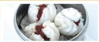
STEAMED PORK BUNS (3) 5.45