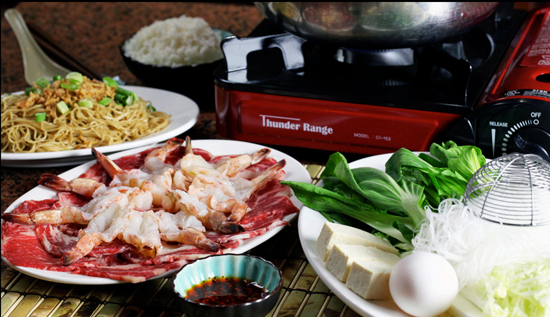
COMBINATION HOT POT