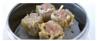
PORK & SHRIMP SIU MAI (4) 5.45