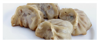
FRIED PORK DUMPLINGS (4) 5.45