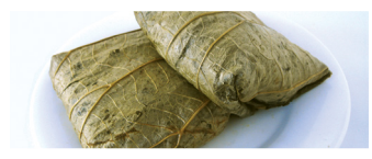
STICKY RICE IN LOTUS LEAVES (2) 7.45