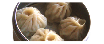
STEAMED PORK DUMPLINGS (4) 5.45