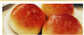
BAKED BBQ PORK BUNS (3) 5.45