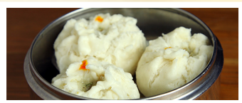
STEAMED CHICKEN & PORK BUNS (3) 5.45