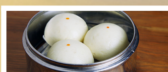
STEAMED TARO BUNS (3) 5.45