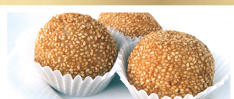
SESAME BALLS (3) 5.45