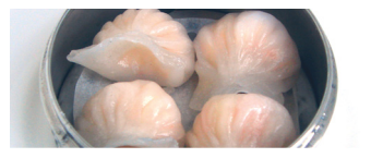
STEAMED SHRIMP DUMPLINGS (4) 5.45

Small dishes traditionally eaten at brunch typically with hot tea. Add a few of our 22 plates to your meal as appetizers or create an entire meal comprised of several dim sum dishes.