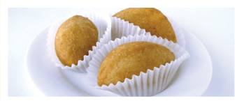
HOM SOI GOK (3) 5.45