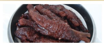
CHICKEN FEET (3) 5.45